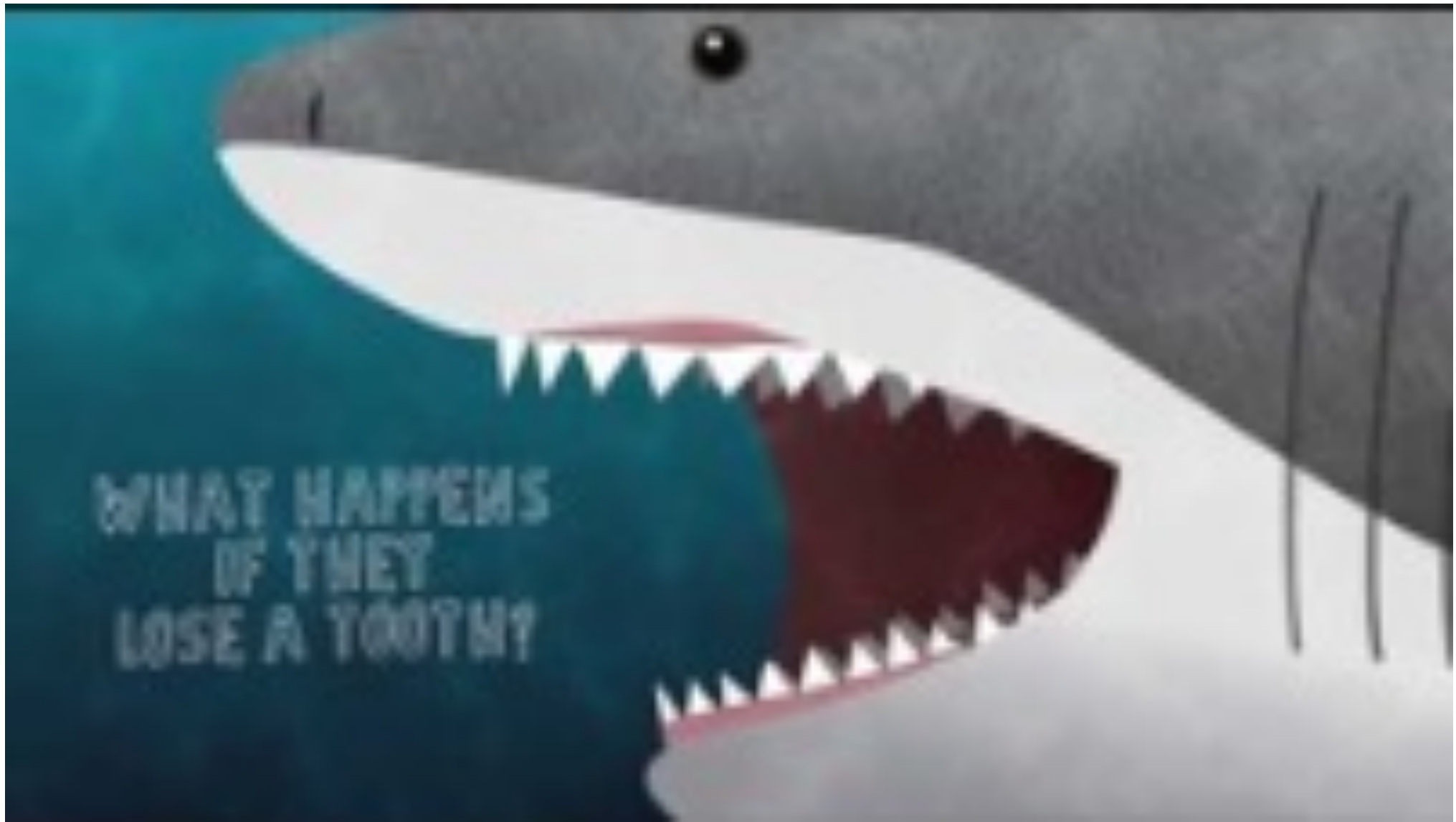
Shark Anatomy – AWSC YouTube